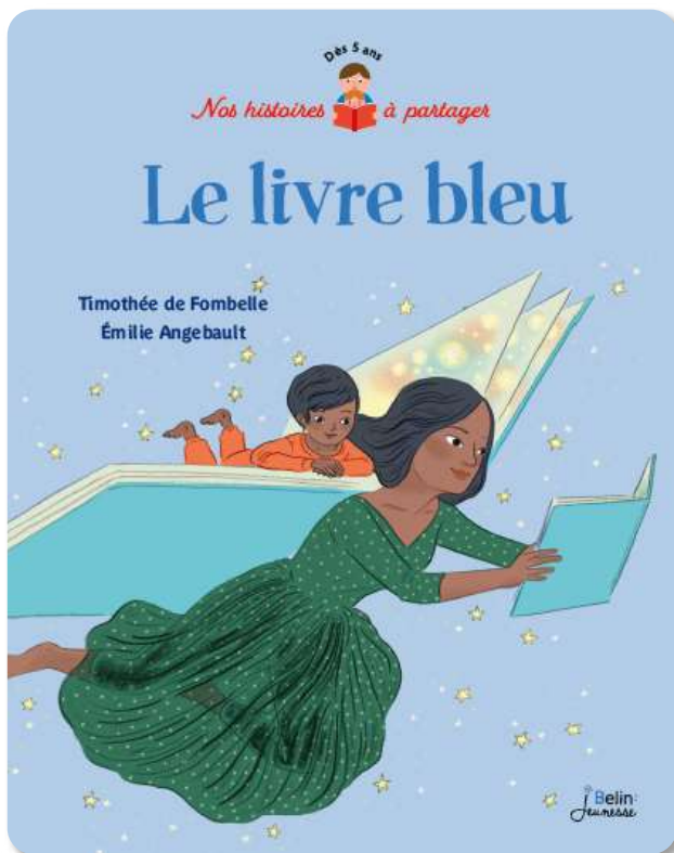
The Blue Book by Timothée de Fombelle & Émilie Angebault

A new collection that promotes the joy of reading by encouraging exchanges between parents and children.